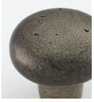
AGED IRON (AI)