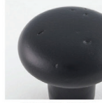
MATTE BLACK (MB)