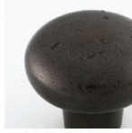
AGED BRONZE (AZ)