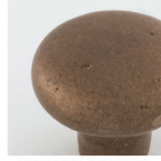
NATURAL BRONZE (NB)