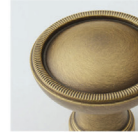
WEATHERED BRASS (WB)