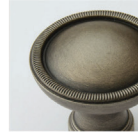
WEATHERED ANTIQUE NICKEL (WA)