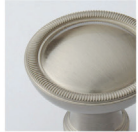
SATIN NICKEL (SN)