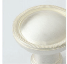
SATIN SILVER (SS)