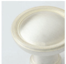
SATIN SILVER (SS)