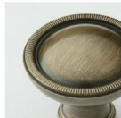
ANTIQUE NICKEL (AN)