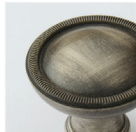
ANTIQUE BURNISHED NICKEL (ABN)