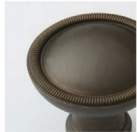
OIL RUBBED BRONZE (BZ)