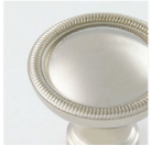
REVERE NICKEL (RN)