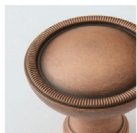
WEATHERED COPPER (WC)