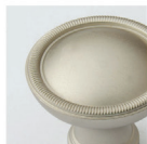
WEATHERED NICKEL (WN)