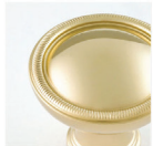
POLISHED BRASS (PB)