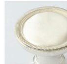
POLISHED SILVER (PS)