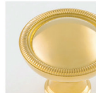
POLISHED GOLD (PG)