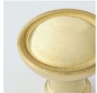
REVERE BRASS (RB)