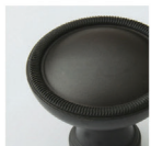
WEATHERED BRONZE (WZ)