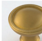
SATIN TARNISHED (STN)