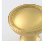
SATIN BRASS (SB)