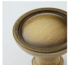
ANTIQUE BRASS (AB)