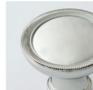
POLISHED CHROME (PC)