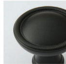
MATTE BLACK (MB)