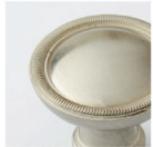
BURNISHED NICKEL (BN)