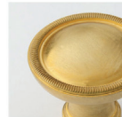
BURNISHED BRASS (BB)