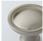
SATIN NICKEL (SN)