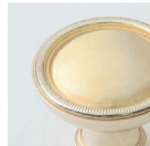
ANTIQUE POLISHED SILVER (APS)