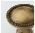
ANTIQUE BURNISHED BRASS (ABB)