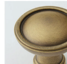
WEATHERED BRASS (WB)