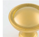
SATIN GOLD (SG)