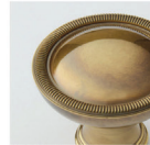
POLISHED ANTIQUE (PA)