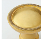
REVERE TARNISHED (RT)