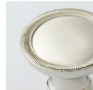
POLISHED NICKEL (PN)