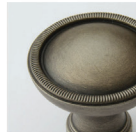
WEATHERED ANTIQUE NICKEL (WA)