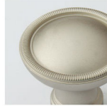
WEATHERED NICKEL (WN)