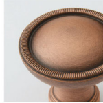
WEATHERED COPPER (WC)