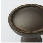
OIL RUBBED BRONZE (BZ)