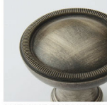
ANTIQUE BURNISHED NICKEL (ABN)