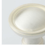
SATIN SILVER (SS)