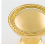
POLISHED GOLD (PG)