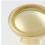
POLISHED BRASS NO LACQUER (PBNL)