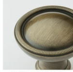
ANTIQUE NICKEL (AN)