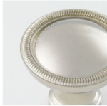
REVERE NICKEL (RN)