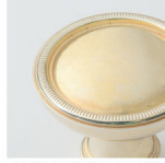
ANTIQUE POLISHED SILVER (APS)