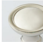
POLISHED NICKEL (PN)