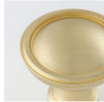
SATIN BRASS (SB)