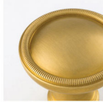
SATIN TARNISHED (STN)