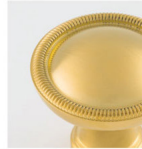
SATIN GOLD (SG)