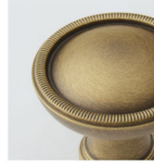
WEATHERED BRASS (WB)