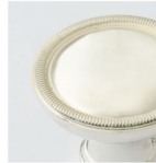
POLISHED SILVER (PS)