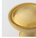
BURNISHED BRASS (BB)