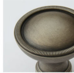
WEATHERED ANTIQUE NICKEL (WA)