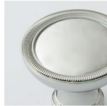
POLISHED CHROME (PC)