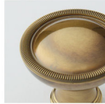
POLISHED ANTIQUE (PA)