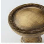
ANTIQUE BURNISHED BRASS (ABB)